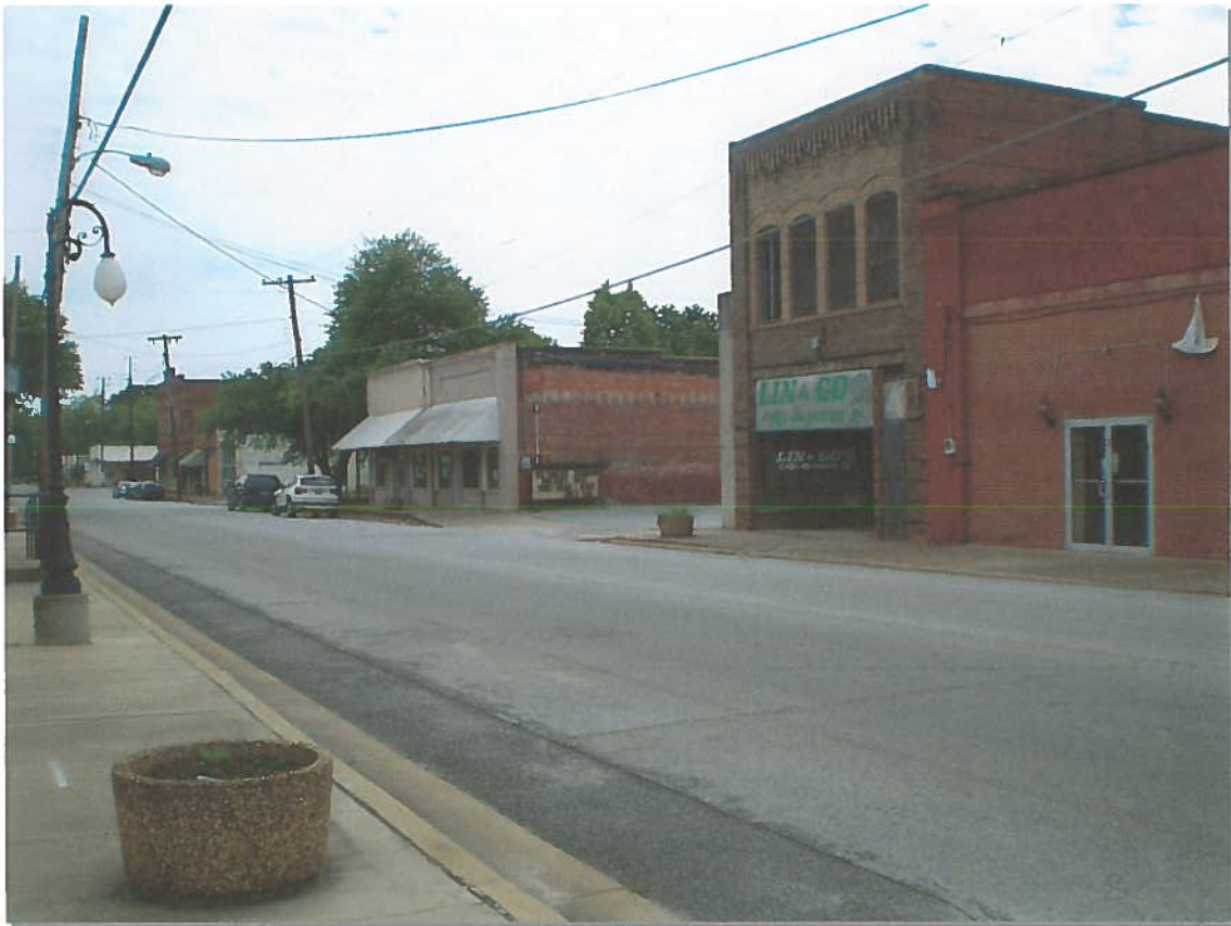
Main Street; Hurtsboro, AL

Prepared for the RPO by the Lee-Russell Council of Governments August 24, 2015